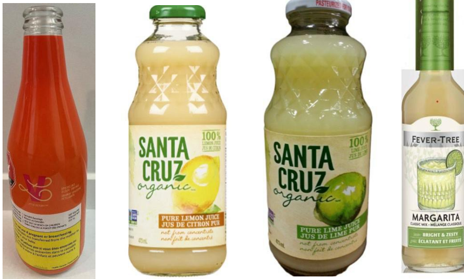
Non alcohol, non concentrate drink mix