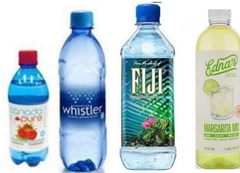
Non alcoholic, non concentrate drink mix