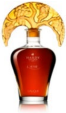
Hardy Lalique Lete