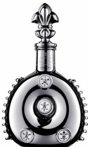
Louis XIII Black Pearl