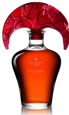
Hardy Lalique L'automne