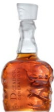
Dictador Generations En Lalique