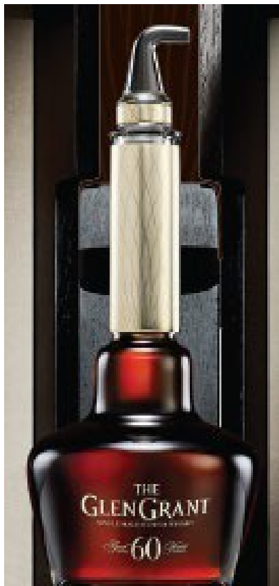
Glen Grant 60YO