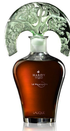
Hardy Lalique Printemps