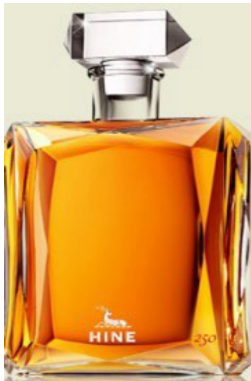
Hine 250 Cognac