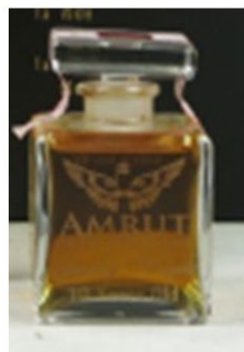
Amrut Greedy Angels 10yo